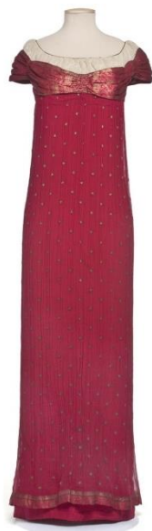
Eugénie 1907, showing Poiret's Directoire style in a bright Fauve pink.