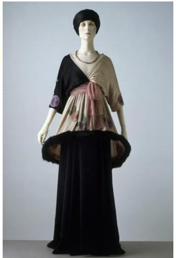
Fig. 10 Sorbet, 1912, a skirt and tunic with a hoop hemline, was a later version of the lampshade dress.