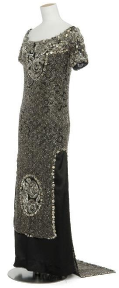
Robe du soir, 1907 Poiret predicts the straight lines of the 1920s with this sumptuously decorated dress.