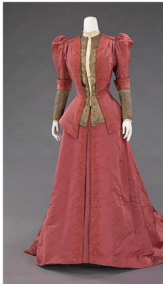
Dinner dress, House of Worth ca.1900. The tailored hourglass shape dominated for 400 years.