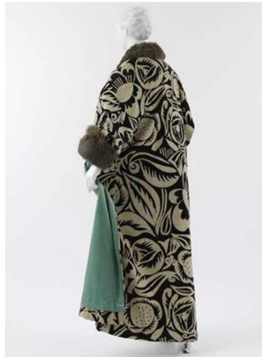
Fig. 7 La Perse coat, 1911. Textile design is a Raoul Dufy block print. Source: http://www.metmuseum.org

In 1908 Poiret commissioned Paul Iribe (1883-1935) to illustrate Les Robes de Paul Poiret racontée par Paul Iribe , and Georges Lapape (1887-1971) to illustrate Les Choices de Paul Poiret in 1911 in a deliberate attempt to connect his Oriental inspired pantaloons, tunic dresses and turbans with art (Rosembaum n.d.). Illustrators like Bakst, Lepape, Iribe, Erté, and Dufy created exquisite stylised illustrations to create an ambience which added elegance, glamour and value to the garment. In 1912 Poiret was also a sponsor for Lucian Vogel's La Gazette de Bon Ton (Steele 1998). Fig. 8 shows how The Oriental style was illustrated for Poiret by Georges Barbier for Les Modes .