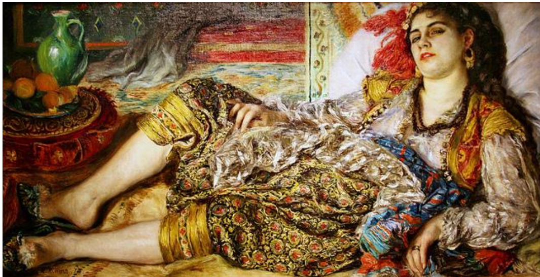
Fig. 3 Odalisque , 1870, Auguste Renoir. Oil on canvas, 69.2 x 122.6 cm, National Gallery of Art, Washington.

Artists had traveled to the Orient since the 16 th Century and returned to Europe with sketches, paintings, and curiosities (Rosembaum n.d.). Expeditions continued into the 19 th century when Eugene Delacroix painted romanticized harem scenes and J.A.D. Ingres appealed to western desire with his more erotic vision (Martin 1994). Renoir visited North Africa and used prostitutes as models. His Odalisque of 1870 (Fig. 1) is a tribute to Delacroix and precursor to the equally decorative, but flatter, paintings of odalisques by Matisse. Renoir's confronting work returns the viewer's gaze and offers all the perceived temptations of the East in a manner artists were reluctant to depict for women of the West. The Gaze was a significant factor in Poiret's work. He was bestowing the desire for the odalisque on his clients. A woman wearing Poiret was meant to be seductive and seen (Lemaire 2001).