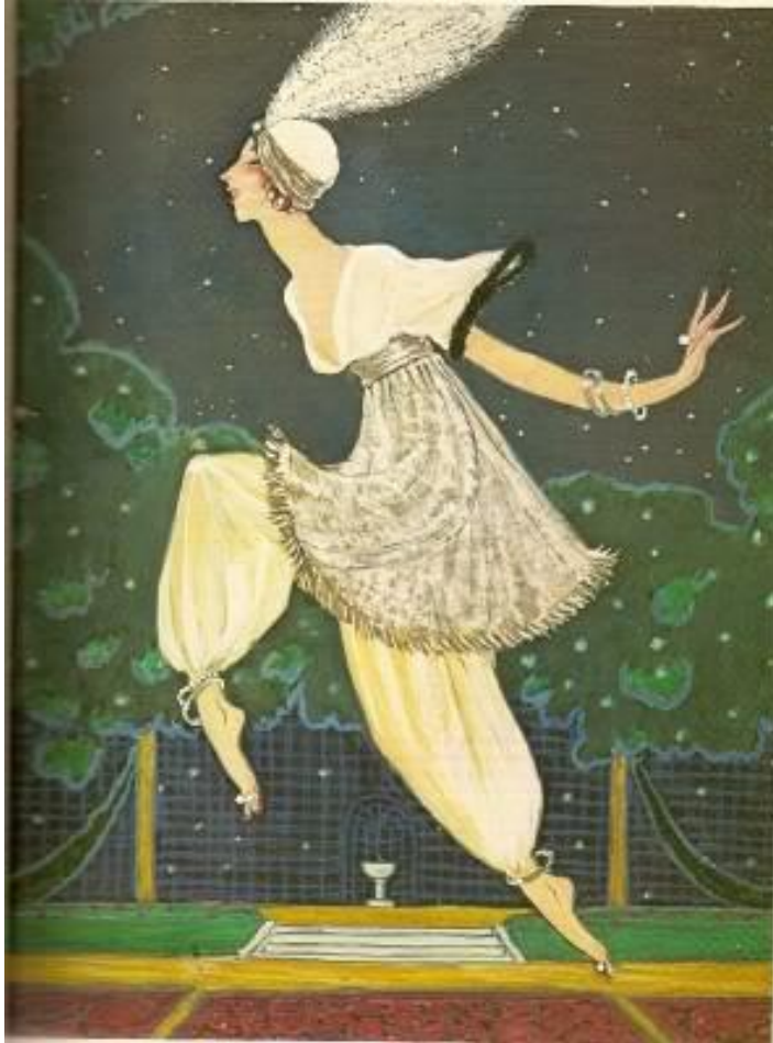
Fig. 9 Georges Lepape's interpretation of Denise Poiret's lampshade dress and turban, 1911.