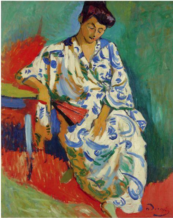
Fig 6 Andre Derain Madame Matisse au kimono, 1905 Oil on canvas 80.5 x 65 cm