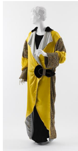
Opera coat, 1912, Paul Poiret. Poiret's cocoon shape in bright yellow.