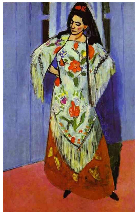
Fig. 4 The Manilla Shawl , 1911, Henri Matisse, Oil on canvas, 118 x 75.5 cm